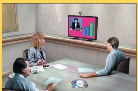
Corporate. Deliver a presentation they'll remember using the LCD3000. Ideal for board rooms, conference rooms and large offices, this monitor's ability to display crystal-clear text and precise images adds clarity and profoundness to spreadsheets, documents and graphics-based presentations. Picture-in-picture capability allows your group to simultaneously view multiple applications, such as a spreadsheet and full-motion video conference.